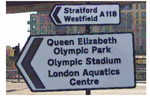
RELOCATED EXISTING DIRECTIONAL TRAFFIC SIGNS TO BE MOUNTED ON NEW POST.