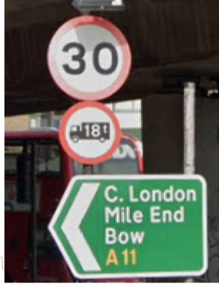
EXISTING '30MPH', DIRECTIONAL AND '18T' TRAFFIC SIGNS RELOCATED ON NEW WIDE-BASED POST.